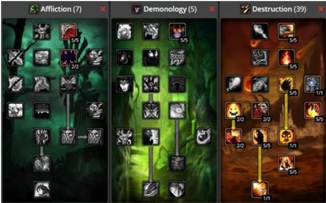
Wowhead destruction warlock pvp guide.